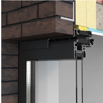
Example: Option design exterior cover – standard installation

Supply in the dry rooms via Invisivent® AIR Extraction in the wet rooms via Healthbox® 3.0