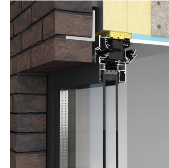
Example: Option design exterior cover – completely recessed installation

Supply in the dry rooms via Invisivent® COMFORT Extraction in the dry and wet rooms via Healthbox® 3.0 [SmartZone]